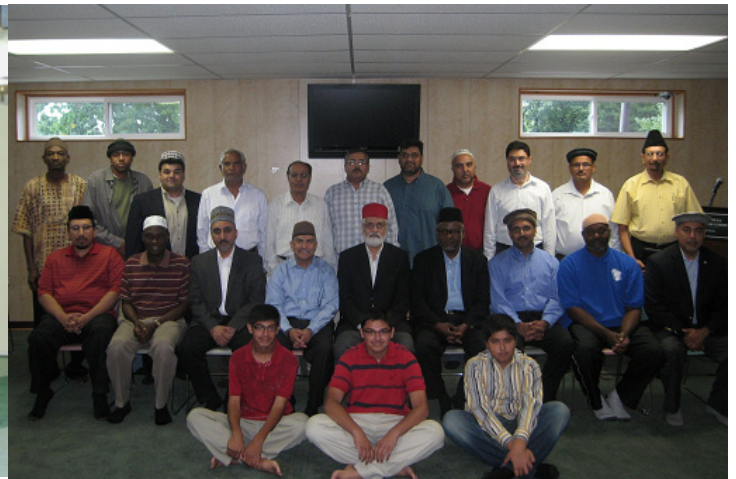
Āmilah members of Majlis Anşarullāh, USA with members of Zion Jamā'at during their visit to Zion on August 26, 2012