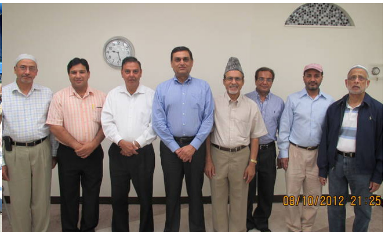
Ansār of Syracuse Majlis at a local meeting at Baitul Ihsan Mosque held on August 10, 2012