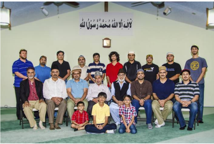
Members at the local Ijtimā' of Dallas Majlis held at Baitul Muqet Mosque on May 5, 2012