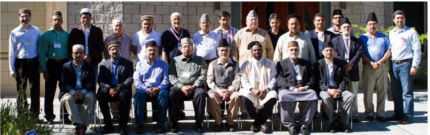
Anşār at regional Ijtimā' of Great Lakes Region held on September 8-9, 2012 at Masjid Mahmood in Detroit