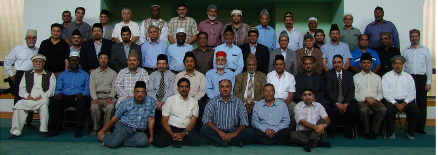
Āmilah members of Majlis Anṣārullāh, USA with local Anṣār at Baitul Jaamay Mosque during their visit to Chicago on August 25, 2012

اے وہ لوگو جو ایمان لائے ہو! صبر کرو اور صبر کی تلقین کرو اور سرحدوں کی حفاظت پر مستعد رہو۔ اور اللہ سے ڈرو تا کہ تم کامیاب ہو جاؤ۔