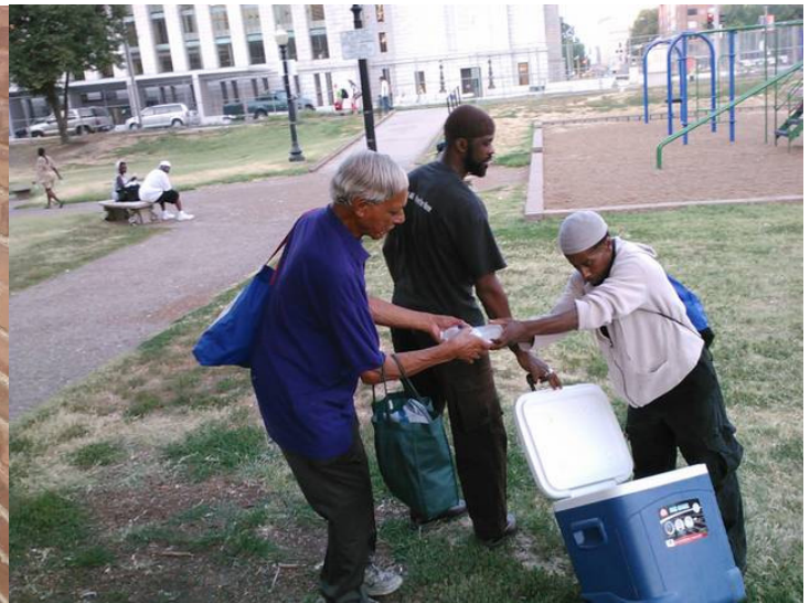
Ansār of St. Louis Majlis distributed over 100 bag lunches and cold water to the less fortunate in downtown St. Louis on August 5, 2012.