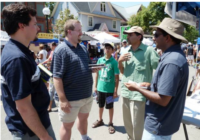
Ansār of Detroit Majlis at a Tabligh stall held on July 18, 2012 at the 53 rd Annual Ann Arbor Art Fair