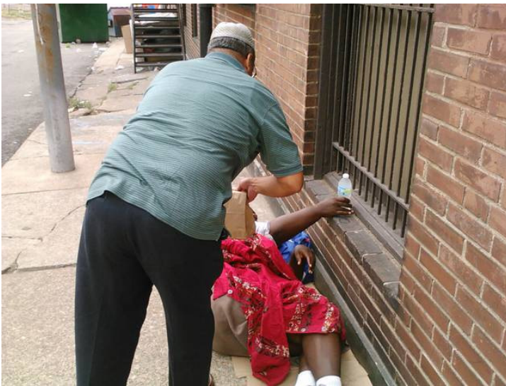
Ansār of St. Louis Majlis passed out water to the needy on July 14, 2012 in the intense heat that gripped the area for many days.